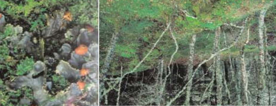
Old enclosure dyke Seann bhalla dìon