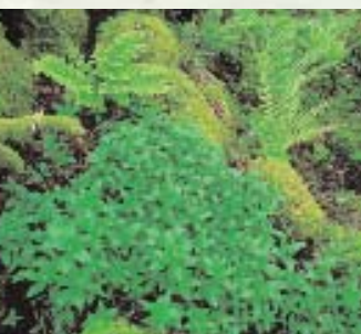
Dog's Mercury Lus ghlaime bhacadail

To the west, more base-rich soils support more ash uinnseann and elm leamhan trees. Herbs such as sanicle, woodruff, dog's mercury and enchanter's nightshade that grow here also like fairly rich, basalt-derived soil.