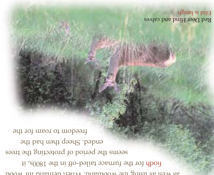
Red Deer Hind and calves Eilid is laorgh

Areas not enclosed were important for sheep grazing. A small community at Camas Salach grew crops and shepherded sheep, as well as using the woodland. When demand for wood for the furnace tailed-off in the 1800s, it seems the period of protecting the trees ended. Sheep then had the freedom to roam for the