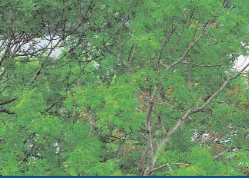
Ash and Rowan trees Uinnsinn is caorainn