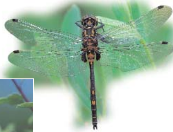
White-faced Darter dragonfly Tarbh-nathrach bhàir

Tha an dòbhran pailt ann an Loch Suaineart agus tha rannsachadh a' sealltainn gu bheil cladach Ghlinn Creabasdaill math air an son. Ach chan ann dìreach ann an sàl a bhios na dòbhrain. Tha e cudromach dhan dòbhran e bhith ga nighe fhèin ann am fìor-uisge airson a bhian a chumail grinn. Faodaidh sgoran nan allt a bhith na