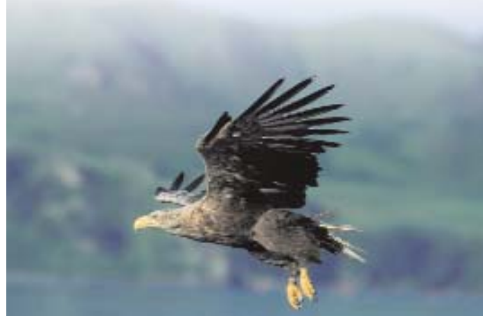
Sea eagle Iolair'-mhara

Ma choisicheas tu on chladach gu mullaich nan cuic, innsidh fuaimenan nan eòin dhut càite bheil na h-àrainnean aca. Tha faoileagan is trilleachain rin cluintinn ris a' chladach agus gocain, brù-dearg, dreathan donn is crìonagan-giuthais sa choille as t-samhradh. Shuas nas àirde, cluinnear clamhain os cionn nan craobhan agus didigein a' ceilearadh sa ghaoith.