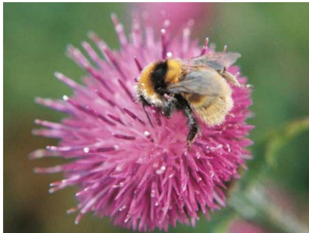
The great yellow bumblebee

Similar schemes are also in place in the Western Isles and the north of mainland Scotland and Orkney. Some crofters may be eligible for support, even if they live outside the core areas. For further information, contact Alan Sillence on 01470 592 357 (alan.sillence@rspb.org).