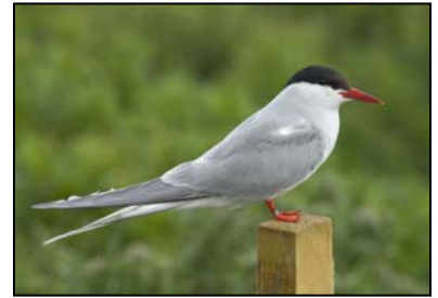
Arctic tern

Scotland holds internationally important numbers of breeding seabirds ( www.jncc.gov.uk/seabirds ). The number of breeding seabirds (abundance) in a given year is a result of how many adults survive from the previous year and how many young birds successfully reach breeding age. Changes within the marine environment such as poor weather and low food availability can reduce adult survival and potentially lower breeding abundance. Some seabirds do not breed every year, so lower breeding abundance does not necessarily mean lower survival rates. The number of chicks produced each year (productivity) gives a good indication of food availability and other factors such as predation and weather conditions. Young seabirds delay breeding until they are three to nine years old (depending on species) and therefore impacts on productivity, and on the survival of young birds to maturity, become evident in the breeding population only after several years.